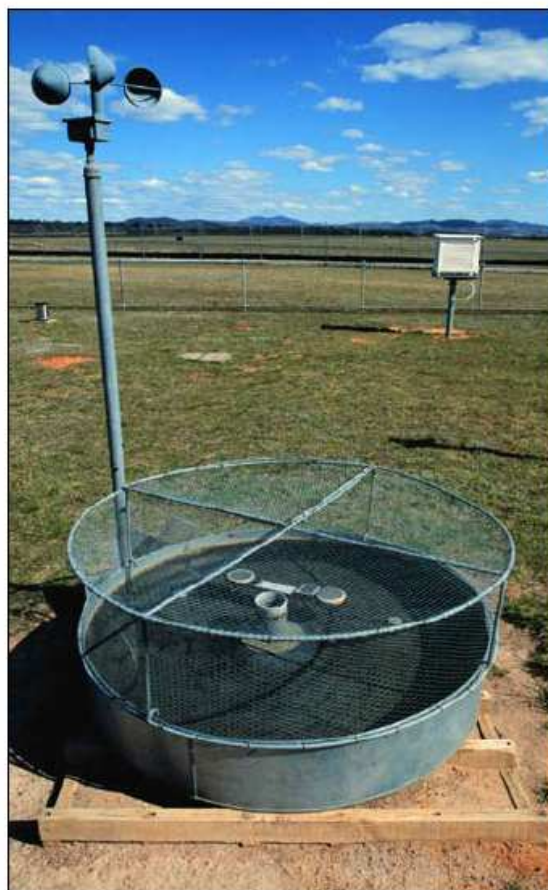
Figure 1. A Class A Pan Evaporimeter run by the Australian Bureau of Meteorology at Canberra Airport.

Why is it so? Is it an artifact of the pan evaporimeter methodology? It was concluded that only one of the known artifacts of pan evaporimeters (as a measure of lake or wet-vegetation evaporation) could cause a decline in readings over several decades. That was the Australian practice of retrofitting bird-guards at various dates for the different pans. However, applying the 7% correction for